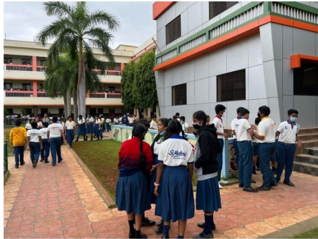
Students of School of Architecture doing a survey on 13-07-2022, @Geethanjali Public school