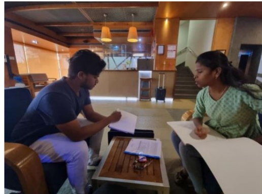
Students of School of Architecture doing a survey on a site visit on 12-07-2022 @Gateway hotel, Vijayawada