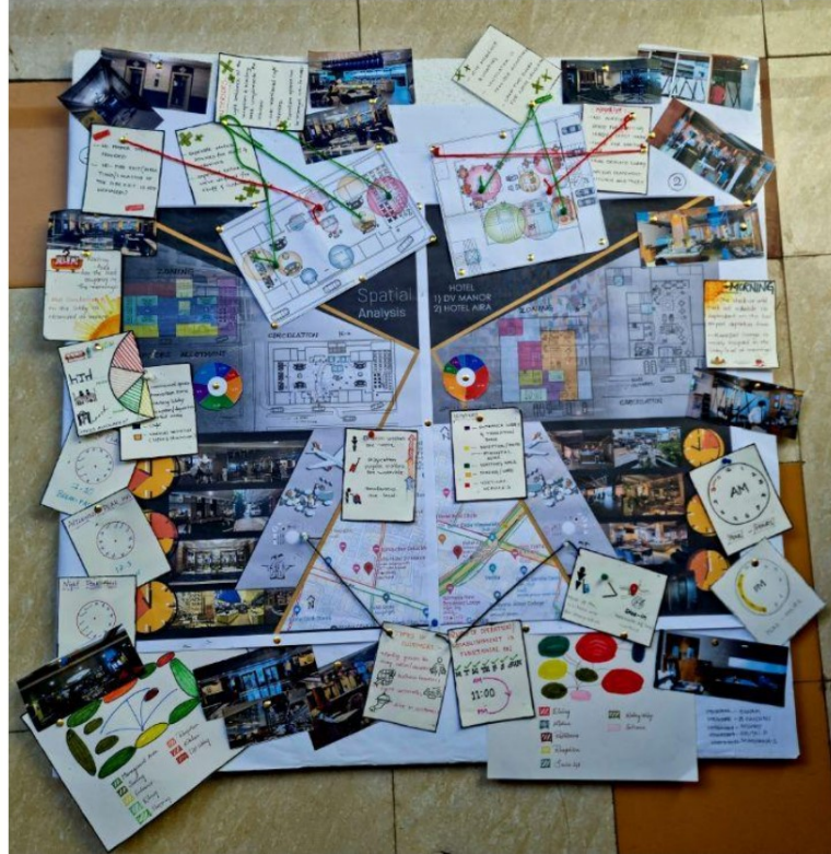
Final mind mapping and inspiration board submission by students on 15-07-2022 @School of Architecture